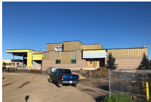
A picture of the school in early June (left) compared to August (right) reveals considerable progress on the new school addition