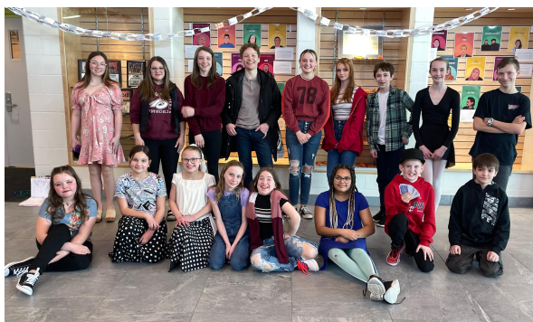
Talent Show Performers